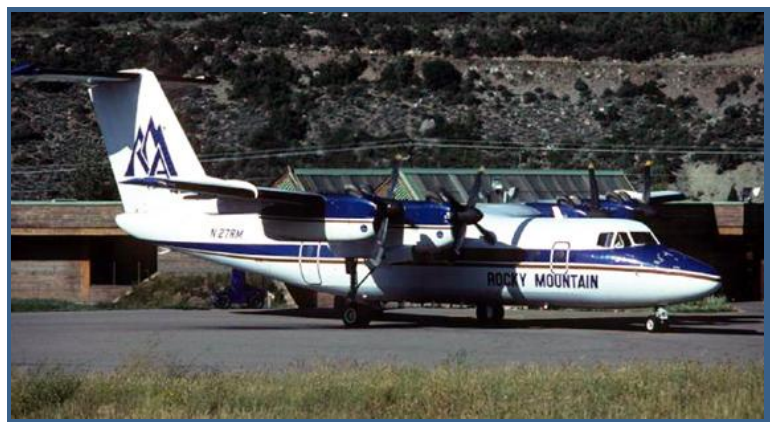
A de Havilland DHC-7 of Rocky Mountain Airways

Times have definitely changed when it comes to the requirements for airline service. Will it ever return to Lake County...who knows? With some improvements to the airport and an increased demand, anything is possible! In the meantime, corporate and business operators have flocked to LXV and found it to be more than suitable for their needs.