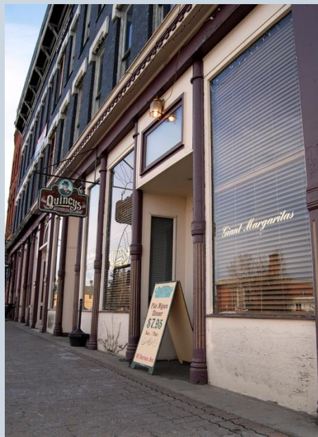
Quincy's Steak & Spirits is conveniently located on historic Harrison Avenue, a very short 2 mile drive from the Airport, in downtown Leadville, CO.